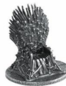
The Iron Throne